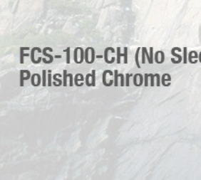
FCS-100-CH (No Sleeve) Polished Chrome