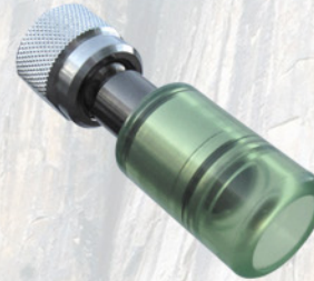
FCS-100-CHG (Sea Green)